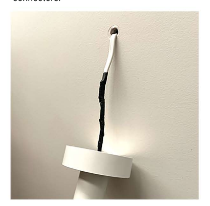
4. Slide the heatshrink into position and