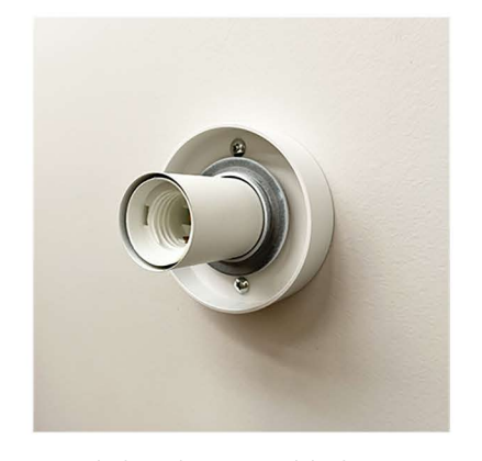
6. Fix the baseplate into a solid substrate with supplied screws.