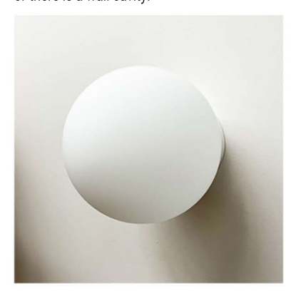
7. Insert the lampbulb and screw on the glass