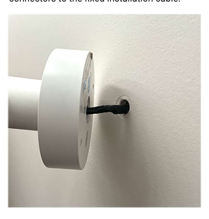
5. Carefully push the cable back into the hole. This is easier if the hole is larger than 16mm or there is a wall cavity.