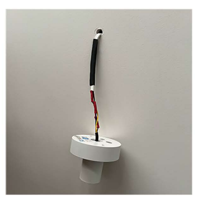
3. Put a length of heatshrink on the fixed installation cable. Connect the crimp connectors to the fixed installation cable.