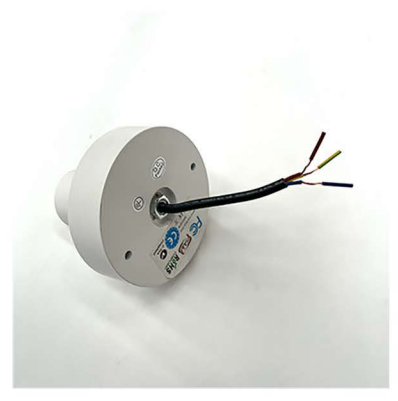
1. Unpack baseplate. Strip outer sheath of cable close to base.